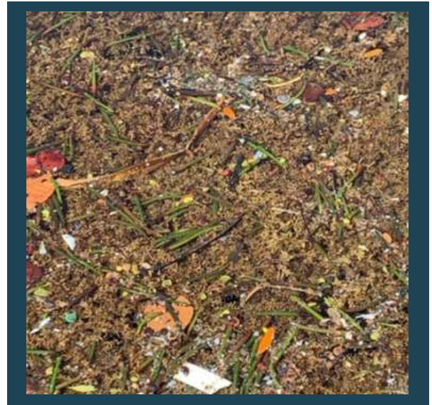
Microplastics float amid Sargassum weed in Fort Lauderdale, Florida

More than half of plastic pollution is more buoyant than water and exists in the surface ocean until it breaks down into fragments called microplastics. Plastics on the surface cause a number of problems, including blocking sunlight and inhibiting photosynthesis, entangling marine species, and ultimately killing organisms. The resulting microplastics also cause a variety of issues in the environment, most notably getting stuck in the digestive tract of vital marine organisms like coral and fish and causing massive die-off. This has implications on human life as well, with plastics entering human bodies through seafood consumption.